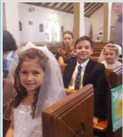
VITALity offers Inclusion

I came that they may have life, and have it more abundantly. John 10:10