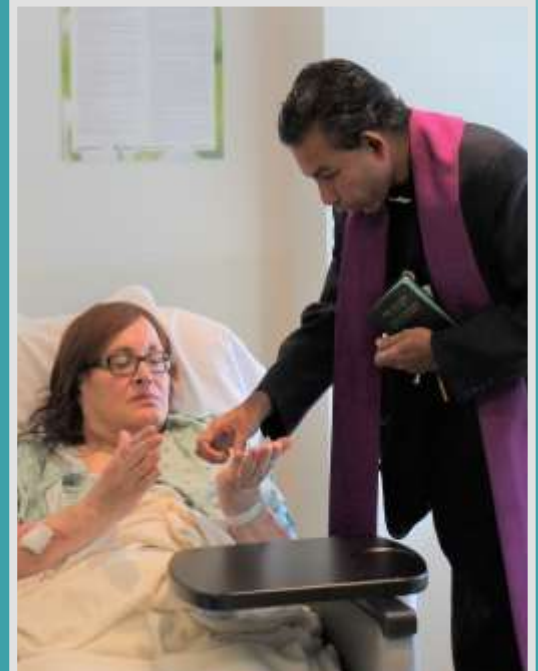
VITALity offers Comfort