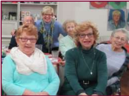
St. Peter Senior Ministry, St. Peter Church

There is a significant need in our community to care for people and their families affected by cancer. Today, almost everyone knows someone who has been touched by cancer. To have support and encouragement is critical to one's health, well-being, peace of mind and recovery. To help those affected by cancer, VITALity Catholic Healthcare Services teamed up with Cancer Treatment Centers of America to train volunteers to lead these ministries. This training equipped ministry leaders with the knowledge to form a parish based cancer ministry to support their parishioners and community members. Today we have 3 active parishes providing practical help, support and hope to the community.