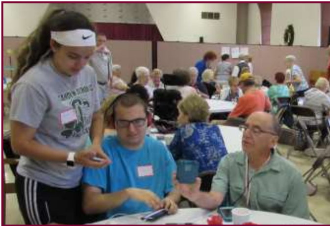
Renaissance Center Senior Ministry, St. Andrew the Apostle

During 2018 our staff visited multiple locations including parish based senior clubs, parish staff members, senior community centers, health fairs, and senior housing residences, to provide health education and to inform them of the free resources VITALity provides to the community. Through these visits we have encountered over 5000 community members and increased our membership enrollment to nearly 1200 members.