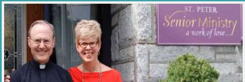
VITALity offers New Life