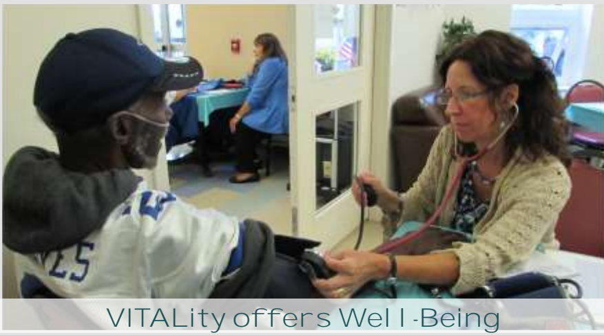
VITALity offers Well-Being