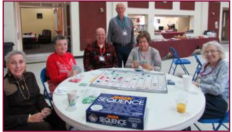
Prime Timers, Church of the Incarnation

We were pleased to announce in September of 2018 the opening of Prime Timers at Church of the Incarnation in Mantua, adding this as the third such Senior Ministry Center in the diocese.