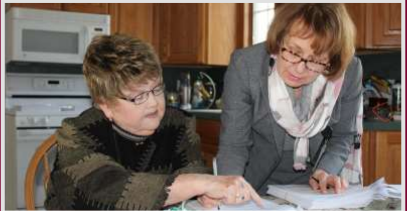
VITALity offers Guidance

I came that they may have life, and have it more abundantly. John 10:10