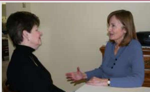
VITALity offers Hope