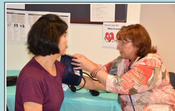
VITALity is health and wellness