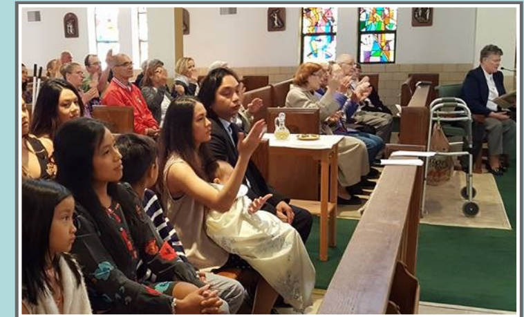
VITALity is inclusion and welcome