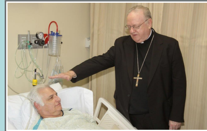
VITALity is healing and comfort