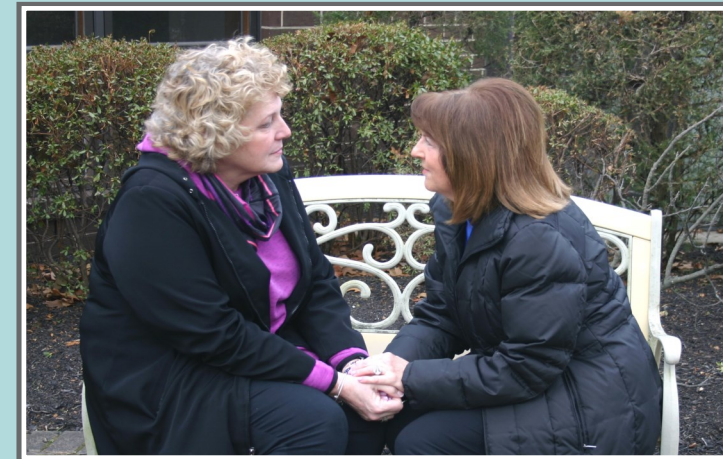
VITALity is caring and listening