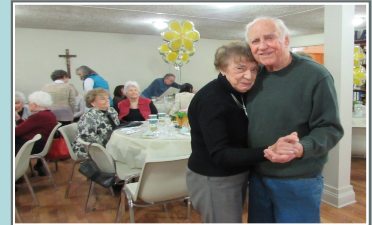
VITALity is community and socialization