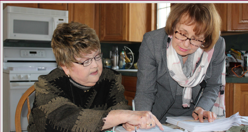
VITALITY OFFERS GUIDANCE

I came that they may have life, and have it more abundantly. John 10:10