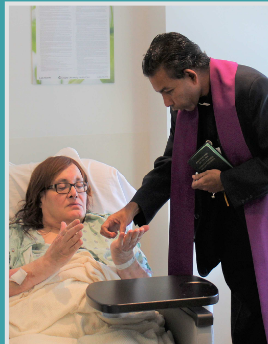
VITALITY OFFERS COMFORT