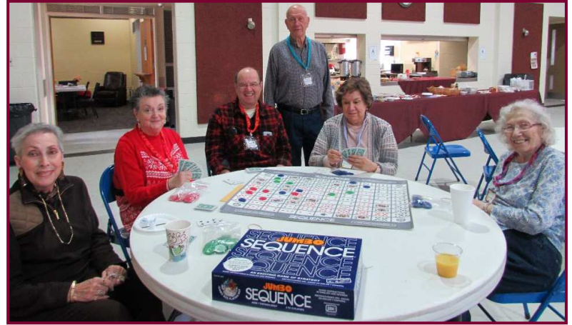
Prime Timers, Church of the Incarnation

We were pleased to announce in September of 2018 the opening of Prime Timers at Church of the Incarnation in Mantua, adding this as the third such Senior Ministry Center in the diocese.