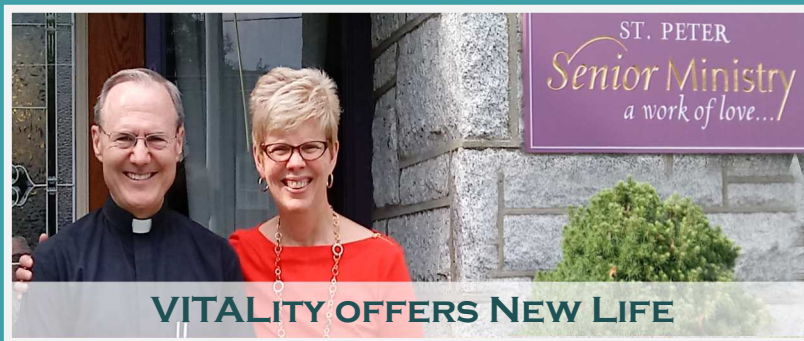
VITALITY OFFERS NEW LIFE