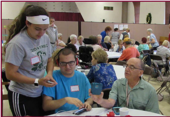
Renaissance Center Senior Ministry, St. Andrew the Apostle

During 2018 our staff visited multiple locations including parish based senior clubs, parish staff members, senior community centers, health fairs, and senior housing residences, to provide health education and to inform them of the free resources VITALity provides to the community. Through these visits we have encountered over 5000 community members and increased our membership enrollment to nearly 1200 members.