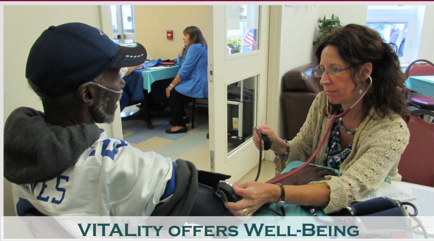
VITALITY OFFERS WELL-BEING