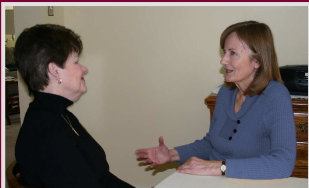
VITALITY OFFERS HOPE