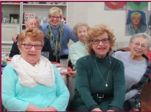
St. Peter Senior Ministry, St. Peter Church

There is a significant need in our community to care for people and their families affected by cancer. Today, almost everyone knows someone who has been touched by cancer. To have support and encouragement is critical to one's health, well-being, peace of mind and recovery. To help those affected by cancer, VITALity Catholic Healthcare Services teamed up with Cancer Treatment Centers of America to train volunteers to lead these ministries. This training equipped ministry leaders with the knowledge to form a parish based cancer ministry to support their parishioners and community members. Today we have 3 active parishes providing practical help, support and hope to the community.